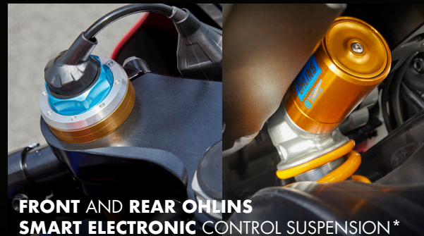
FRONT AND REAR OHLINS SMART ELECTRONIC CONTROL SUSPENSION*