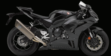
Pearl Morion BLACK